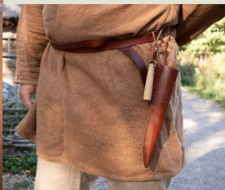
Woolen round hat. Bag with wooden handle. Based on several finds, mostly Hedeby and Birka. The size of the handles varies greatly. The material for the bag is not known, but we suggest fabric, net or leather for reconstructions. Simple knife and wetstone.