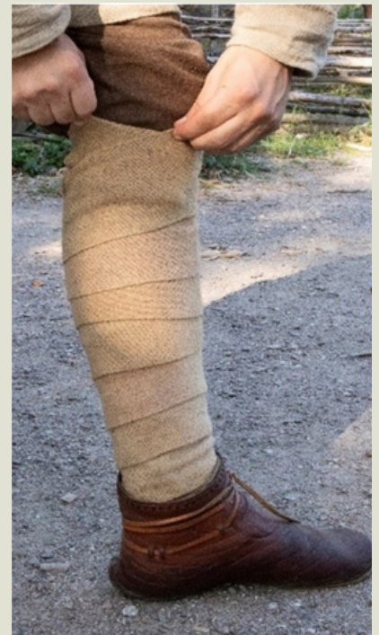
Legwraps and three different ways of securing them